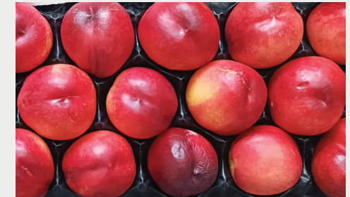
VitaFresh™ Botanicals SoftFruit

After 30 Days in Cold Storage + 3 Days Shelf Life