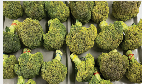
Untreated / Control 12.4% marketable*