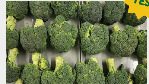
High Dose - 4x 625mg SF InBox sachet/9-10 kg box 99.2% marketable*

*Marketable defined as % with color ≤ grade 3