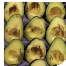
CONTROL @ DAY 6