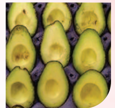
SMARTFRESH QUALITY SYSTEM @ DAY 11