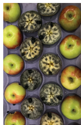
Harvista™ Split Application x2