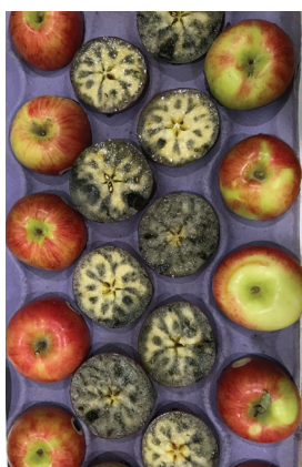
Harvista™ Single Application